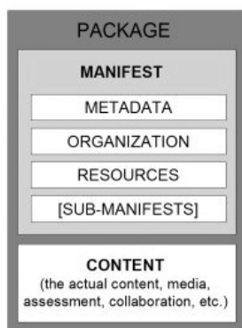
Figure 1: LO Physical Structure (taken from IMS, 2005)

(a) is a straightforward issue, set by LOM and adopted by all standard bodies. For all standards, a LO is a compressed file (e.g. a CAB, TAR, or ZIP file) which contains the content (i.e. the content files) and the metadata, usually coded in XML into a manifest file. The following figure (Figure 1) sketches the structure of a LO according to IMS.