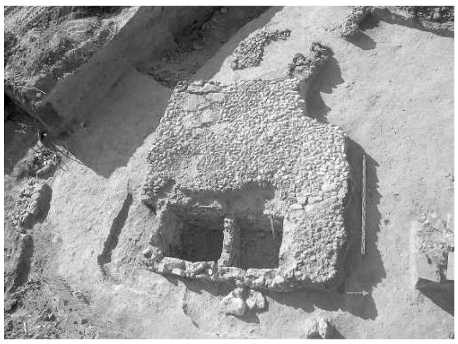
Fig. 2. Settlement Ilyich-1. Excavation "Bereg IV". Winery no. 2