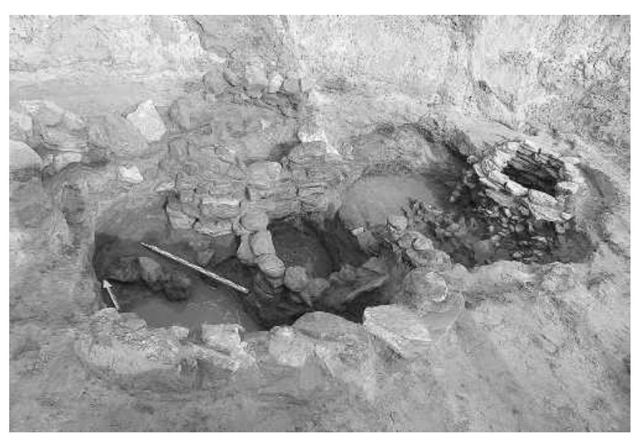
Fig. 3. Settlement Ilyich-1. Excavation "Bereg IV". Reservoir and well