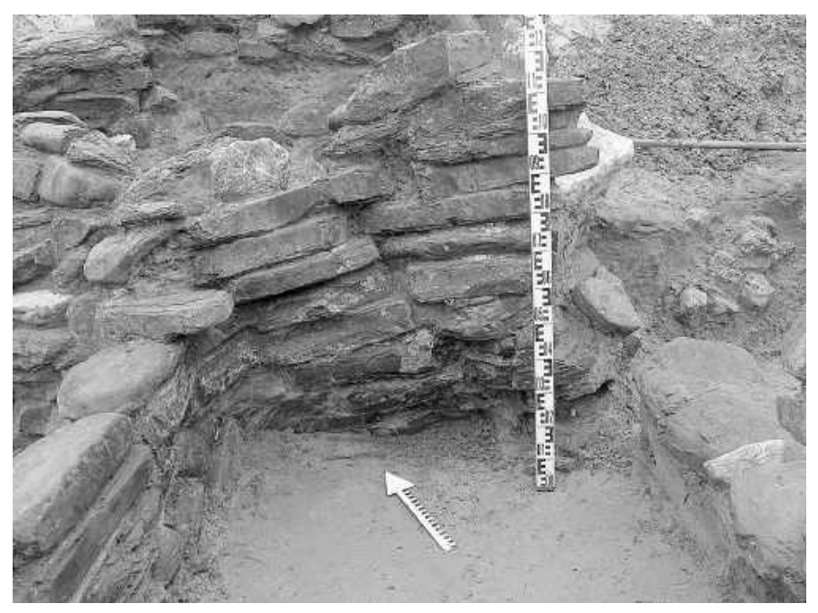
Fig. 4. Settlement Ilyich-1. Excavation "Bereg IV". Reservoir. Masonry of red sandstone