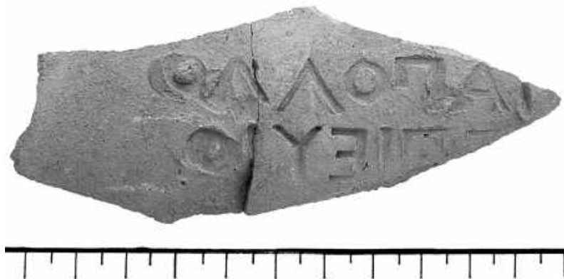
Fig. 2. Fragment of the neck of a Herakleian amphora with a stamp

In addition to the amphora stamps, a stamp Βα[συλική] was found on a Bosporan tile dated to the 290–280 BC or 245–235 BC. All these stamps reliably marked the lower chronological limit of the finds from excavation XLVI. However, along with fragments of imported amphorae of the Classical and Hellenistic period, in this layer, like previously, late Hellenistic amphora remains were encountered dating from the turn of the eras and the Roman period right up to the 3 rd –4 th cent. AD. The chronological span established through the amphorae was confirmed additionally by other ceramic fragments: from red-figured and black-glossed ones, sherds of ‘Megara’ bowls and painted late Hellenistic ware to late red-glossed vessels (3 rd –4 th cent. AD). Probably, the handmade pottery was synchronous to the practised funerary rituals. It included numerous fragments (e.g. examples decorated with ornamentation) found in the fill layer and at the level of the ancient horizon. The identified copper Bosporan coins of Ininthimeos (no. 677 after Anokhin) and Rheskouporis IV (nos. 700, 720) minted between 238/239 and 276/277 AD) 6 defined the terminus post quem of the upper chronological level. Judging by the results of palaeozoological analysis, the range of species of animals and birds, of which the remains were found during recent seasons in excavation XLVI, also did not differ in its composition from the skeletal remains encountered here before.