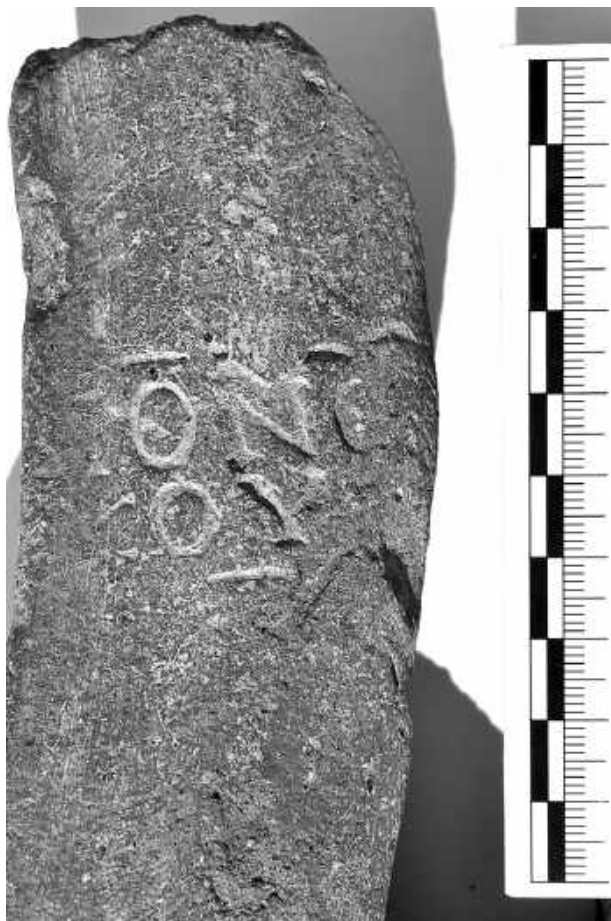
Fig. 3. Fragment of a South Pontic (?) louterion with a stamp

Thus, basing on the evidence now available, it may be supposed that ‘banks’ nos. 4 and 1 belong to a single historical epoch of the 4 th – early 5 th cen. AD and the same ethnocultural unity. They represent funerary and ritual structures never before revealed at Classical Bosphoros, i. e. the preserved part of the late Classical necropolis situated south-west from the townsite of Kytaiion. 9