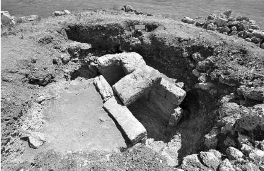
Fig. 5. Chatr-Tav Ridge. Slab tomb in kurgan no. 5